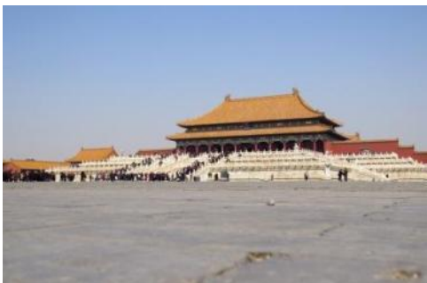
Left to right: Tiananmen Square, Mutianyu Great Wall, Forbidden City. Note the recurring absence of crowds...