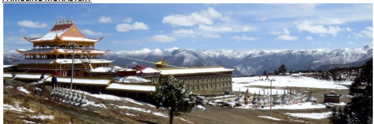
Situated atop a peak at 4,200m with stunning views, it is approached via a long and winding dirt track, with a precipitous drop on one side, wide enough for one and a half cars – which makes it disturbingly interesting when you meet a car coming in the other direction...

The site is well-known to Chinese photographers as a stakeout for Szechenyi's (Buff-throated) Monal-partridge which we eventually succeeded in tracking down shortly before we ran out of sufficient daylight to allow us to negotiate the journey down. Enjoying glorious sunshine looking down on the world, our bird list for the site was limited, but great views of Hill Pigeons, Rufous-breasted Accentor, Pink-rumped & Chinese White-browed Rosefinches were had whilst surrounded by Giant Laughingthrushes that pecked around our feet.