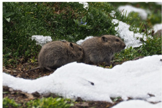
Top to Bottom, Left to Right : Blue Sheep, Tibetan Gazelle, Glover's Pika, Chinese Scrub Vole ( Irene's Mountain Vole )