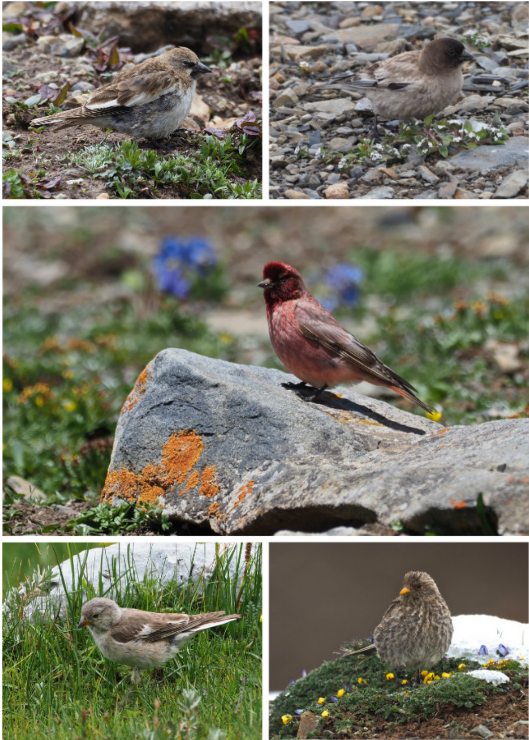
Top to Bottom, Left to Right : White-winged Snowfinch ( Henry's Snowfinch ), Brand's Mountain Finch, Tibetan Rosefinch male, Tibetan Snowfinch ( Black-winged Snowfinch ), Tibetan Rosefinch female © Summer Wong