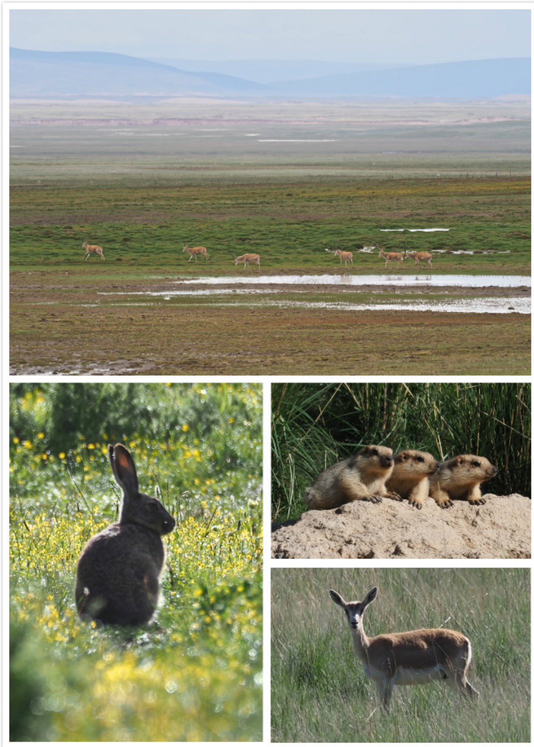
Top to Bottom, Left to Right : Tibetan Antelope, Woolly Hare, Himalayan Marmot, Goitered Gazelle