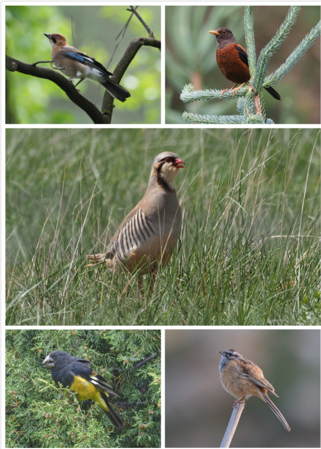
Top to Bottom, Left to Right : Eurasian Jay, Chestnut Thrush, Przevalski's Partridge, White-winged Grosbeak, Godlewski's Bunting