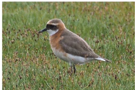
Top to Bottom, Left to Right : Bearded Vulture, Tibetan Bunting, Ground Tit, Lesser Sand Plover