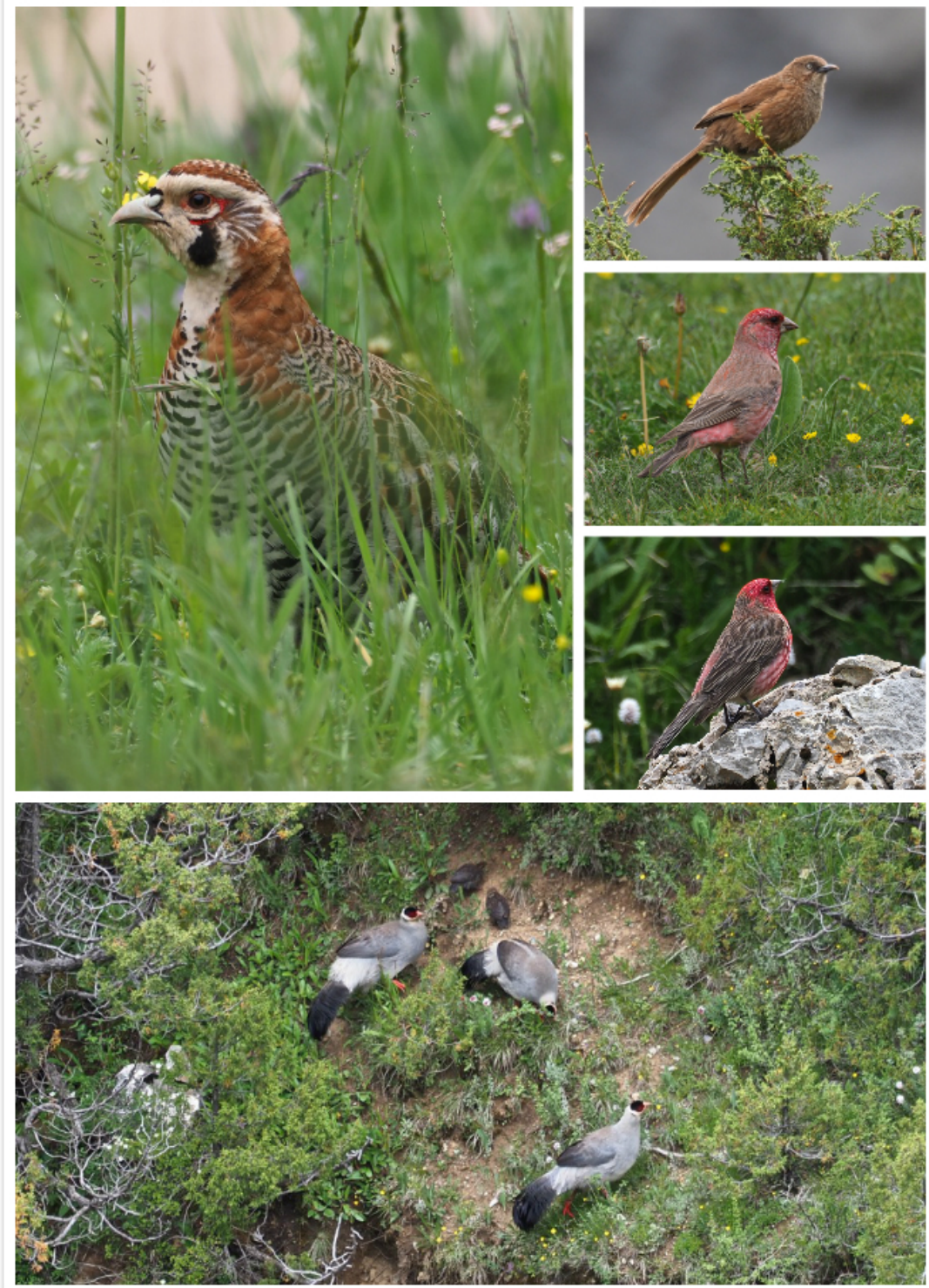
Top to Bottom, Left to Right : Tibetan Partridge, Tibetan Babax, Great Rosefinch, Streaked Rosefinch, White-eared Pheasants with chicks