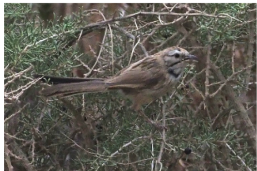
Top to Bottom, Left to Right : Biddulph's Ground Jay, Tarim Babbler, Desert Whitethroat ( Lesser Whitethroat ), Tarim Babbler