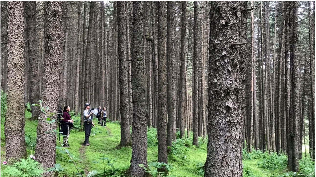
Xining Yaozigou forest

Day 22 July 25 th : We left very early to Lhasa airport for our flight to Chengdu. In Chengdu, it was time to say goodbye. It really had been a fantastic three weeks !!