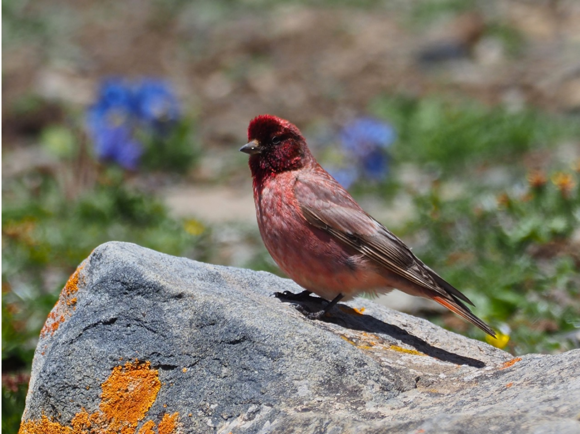
Roborowski's Rosefinch