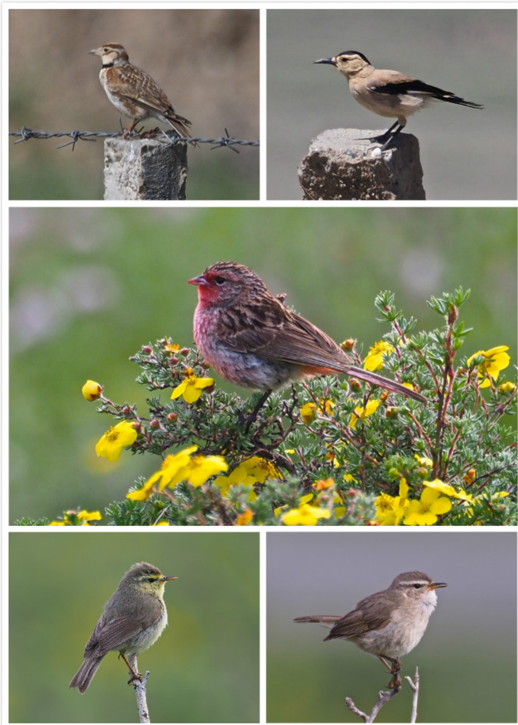
Top to Bottom, Left to Right : Mongolian Lark, Henderson's Ground Jay, Przevalski's Finch, Alpine Leaf Warbler, Smoky Warbler