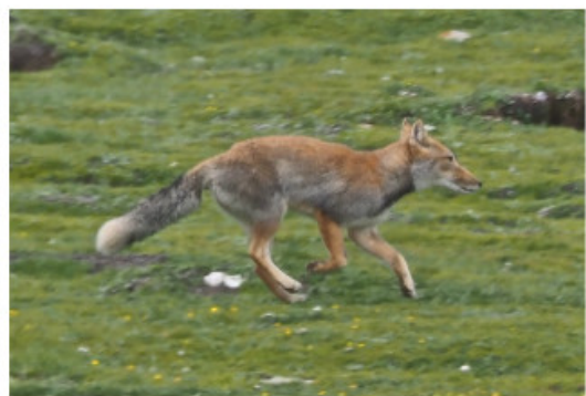
Top to Bottom, Left to Right : Tibetan Antelope, Alpine Musk Deer, Kiang, Tibetan Fox