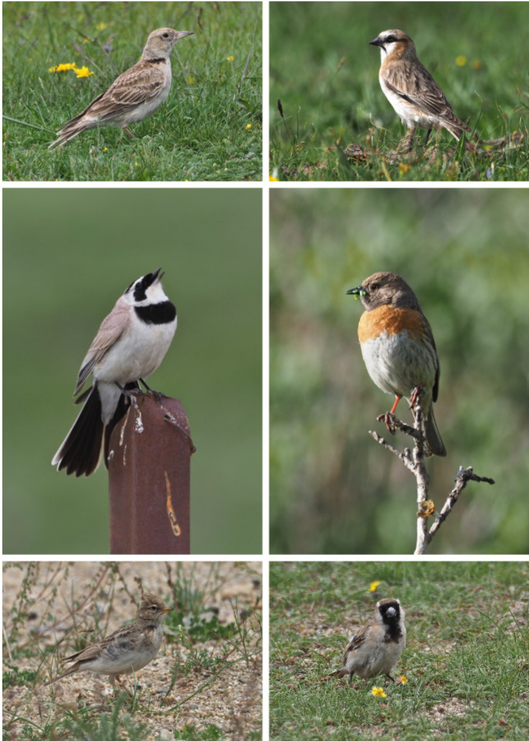
Top to Bottom, Left to Right : Tibetan Lark, Rufous-necked Snowfinch, Horned Lark, Robin Accentor, Hume's Lark, Pere David's Snowfinch