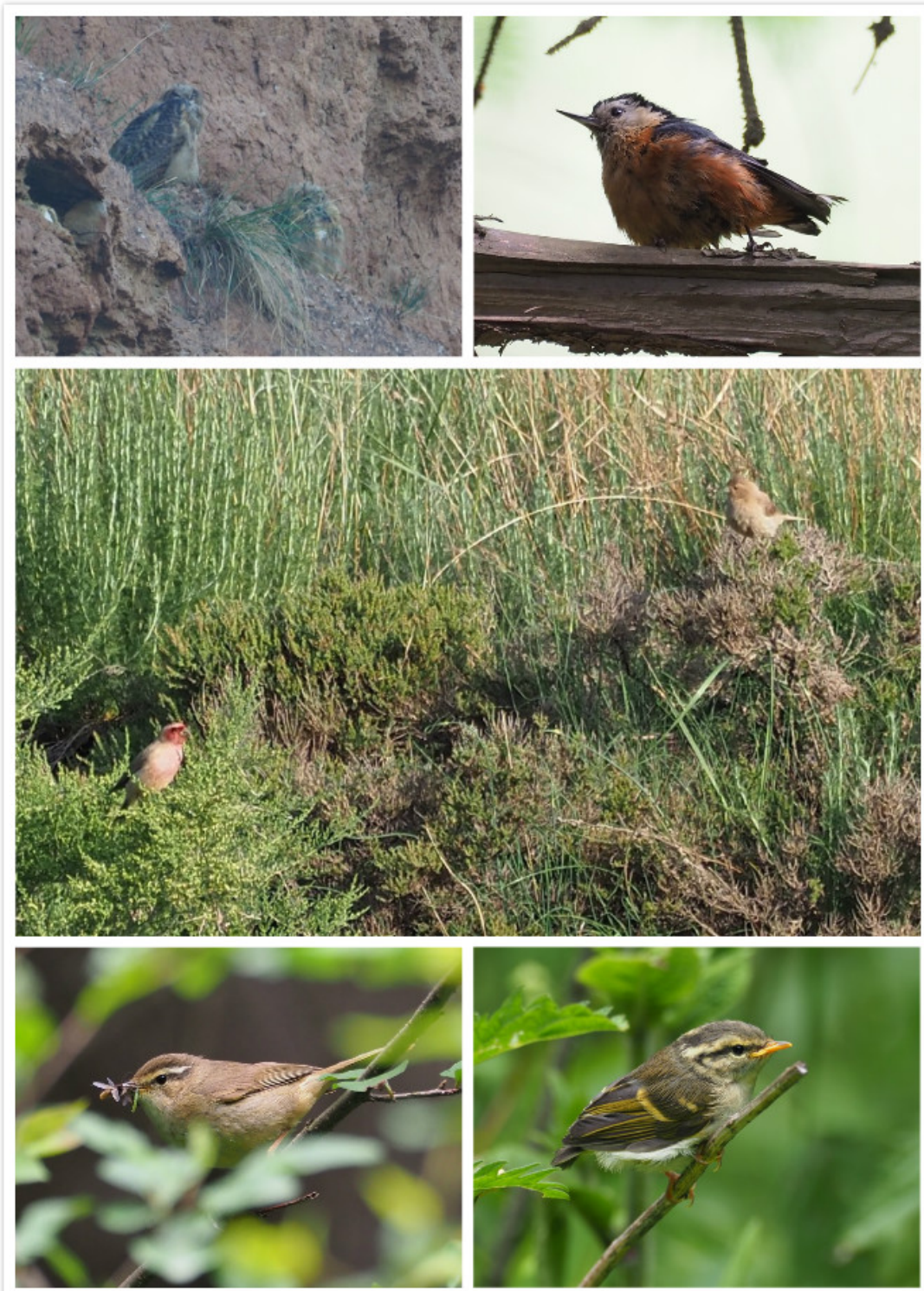
Top to Bottom, Left to Right : Eurasian Eagle Owl, Przevalski's Nuthatch, Pale Rosefinches in pair, Yellow-streaked Warbler, Gansu Leaf Warbler juvenile