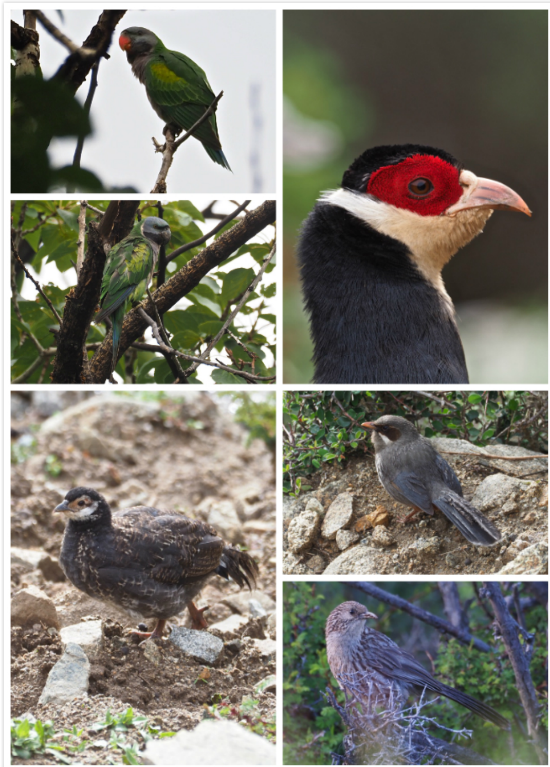
Top to Bottom, Left to Right : Lord Derby's Parakeet male and female, Tibetan-eared Pheasant adult and juvenile, Brown-cheeked Laughingthrush, Giant Laughingthrush