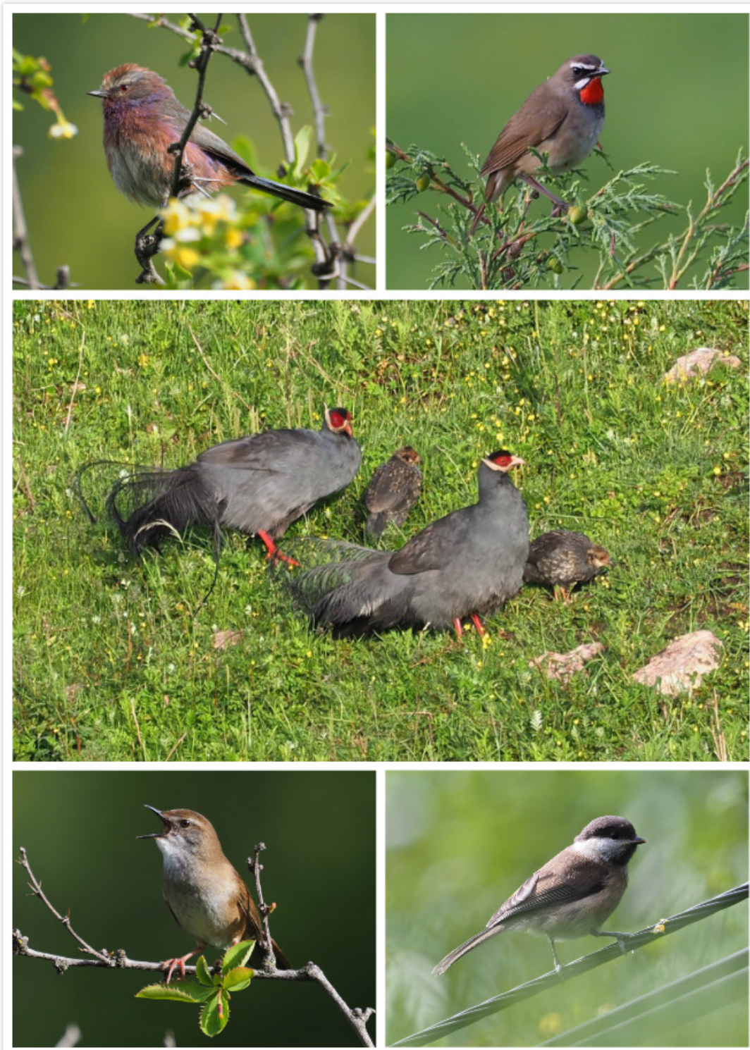
Top to Bottom, Left to Right : White-browed Tit Warbler, Siberian Rubythroat, Blue-eared Pheasant parents with two chicks, Spotted Bush Warbler, Sichuan Tit