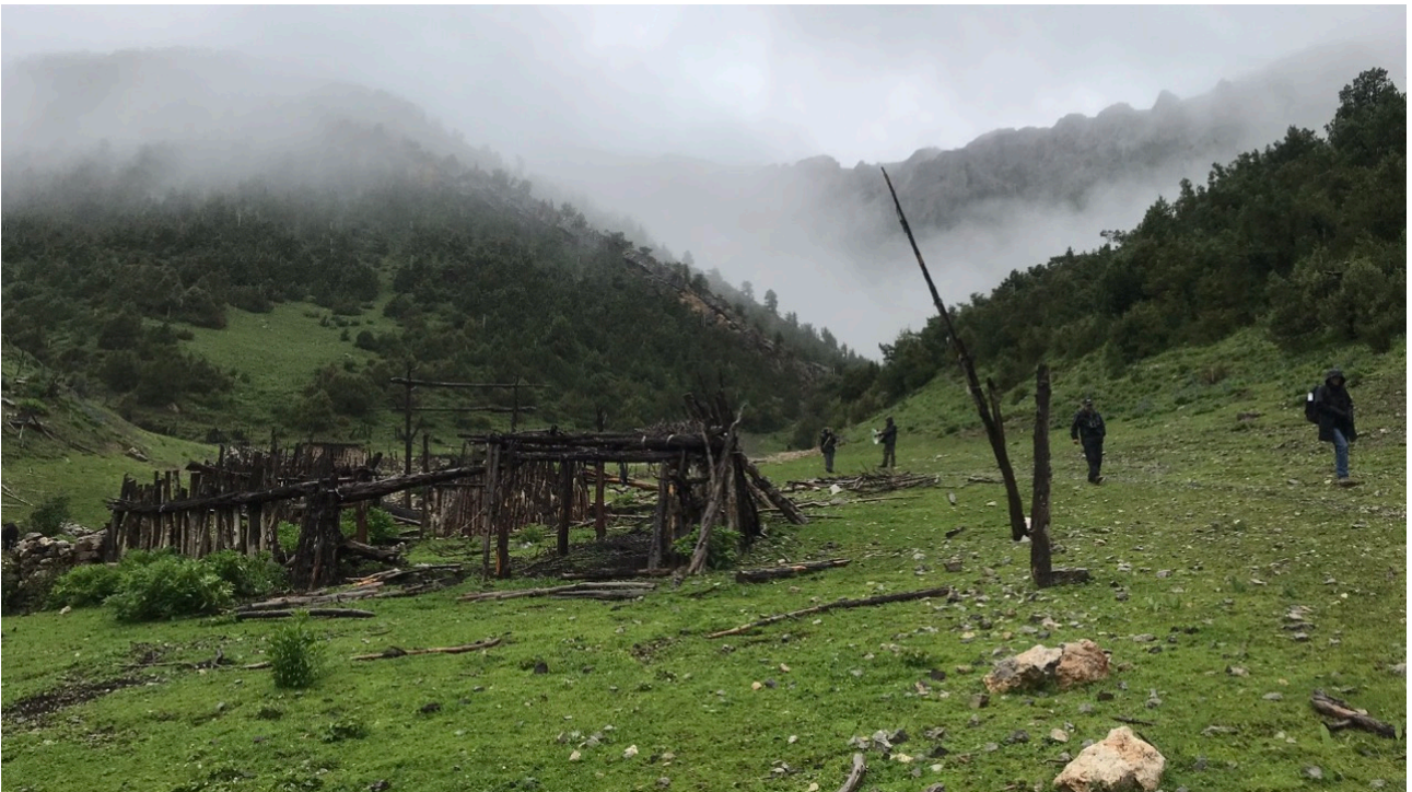
Nangqian Baizha forest

Chinese Scrub Vole ( Irene's Mountain Vole ) / Neodon irene : a group in Er La mountain