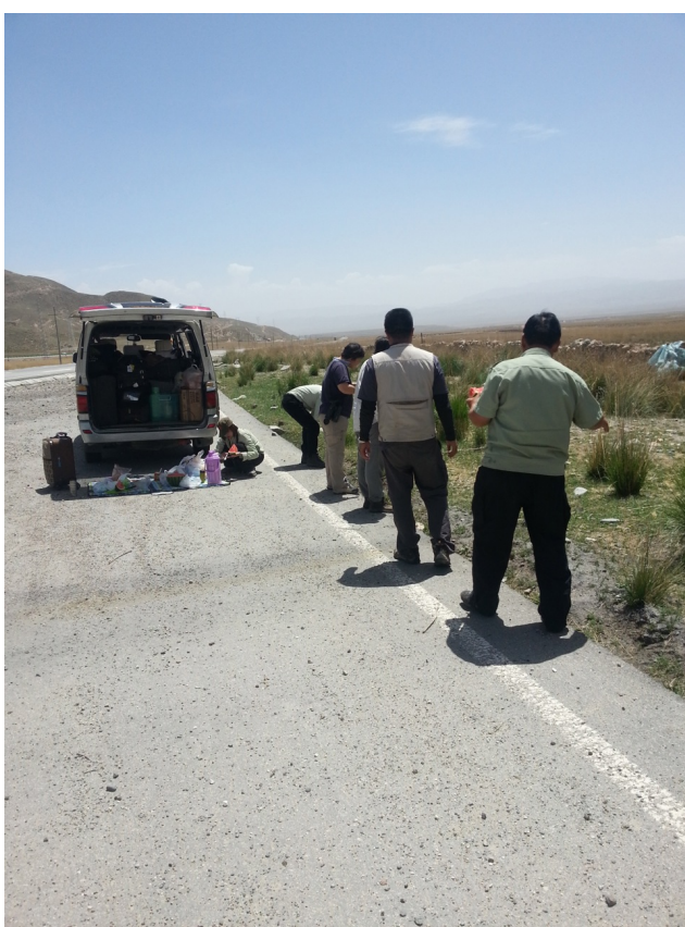
Enjoying watermelon after lunch