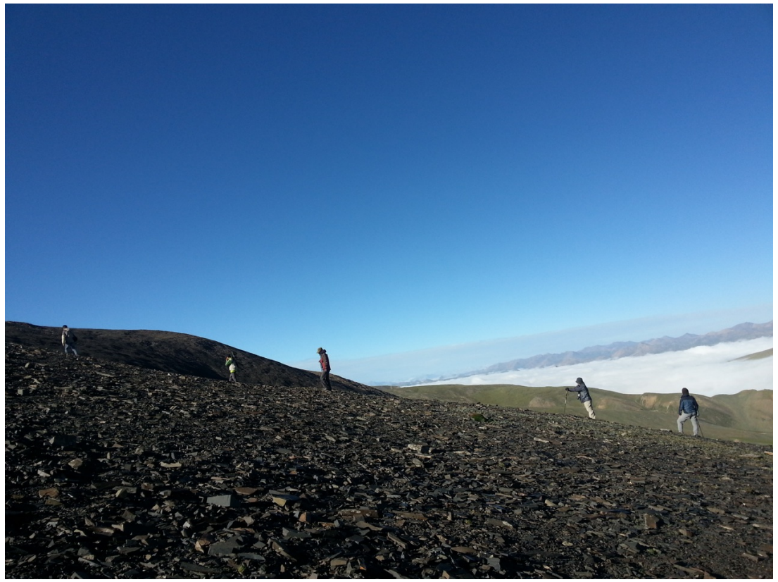
Climbing in Ela Mountain