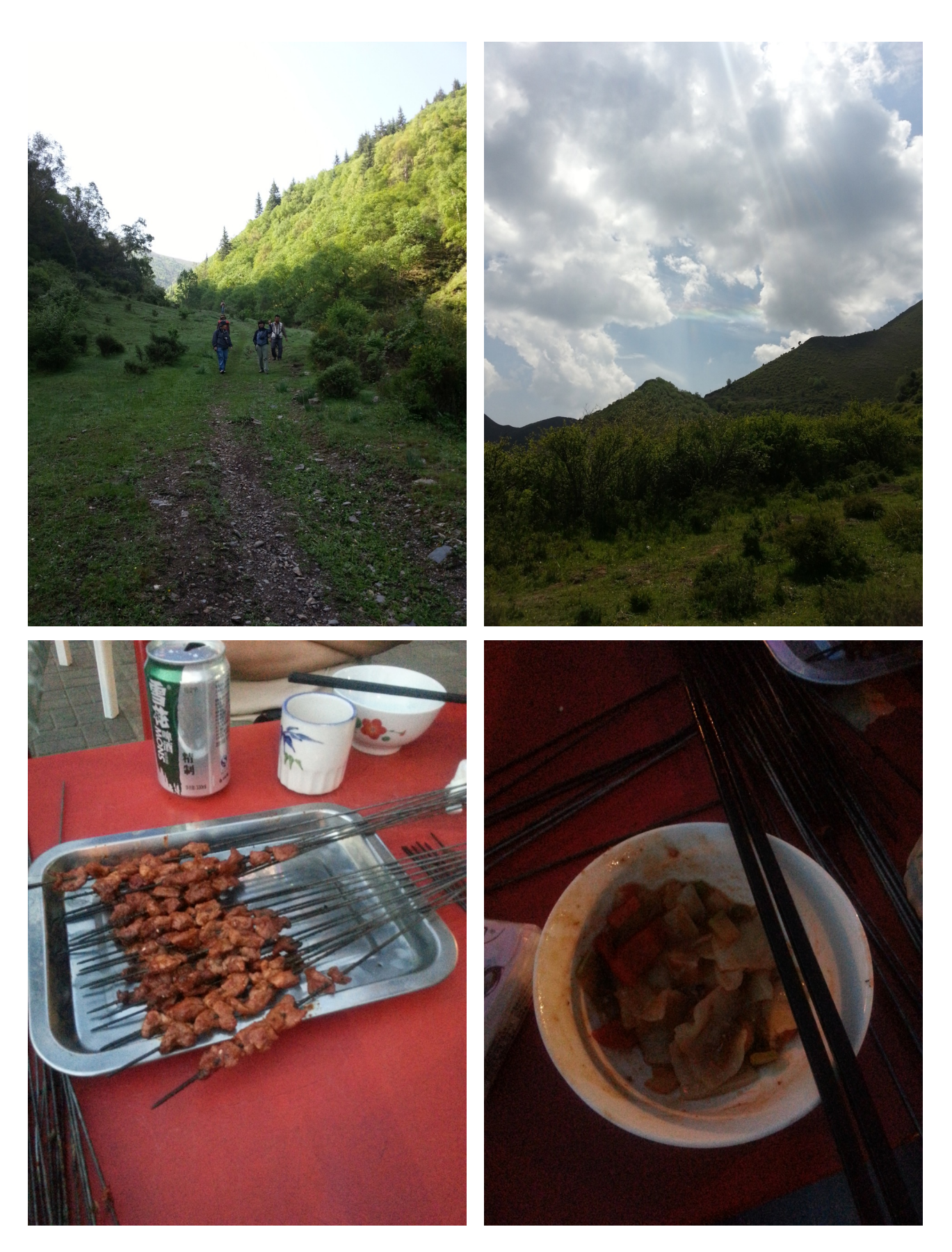
Muslim barbecue & square noodle dinner in Huangyuan