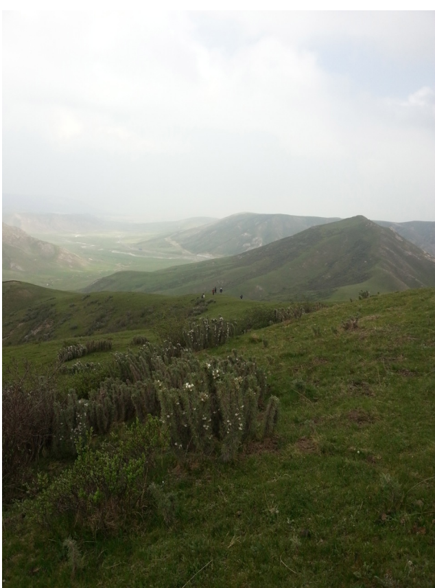
Day 4, 15th June

Heading to Chaka birding on the way near Qinghaihu Lake, got Tibetan Lark, Black-necked Crane, Isabelline Wheatear, Oriental Skylark, Mongolian and Horned Lark, Twite, Rock Sparrow, Rufousnecked, Black-winged and White-rumped Snowfinch, Ground Tit, Brown and Robin Accentor quite common there, Pale Martin, Commone Stonechat, Alpine Leaf Warbler, Common and Upland Buzzard, Golden Eagle, Himalayan Griffon, by hard searching finally got the amazing male Przevalski's Rosefinch (Pink-tailed Bunting) displaying to a female! Also an unexpected male stunning Streaked Rosefinch, Tibetan Partridge. Overnight in Chaka.