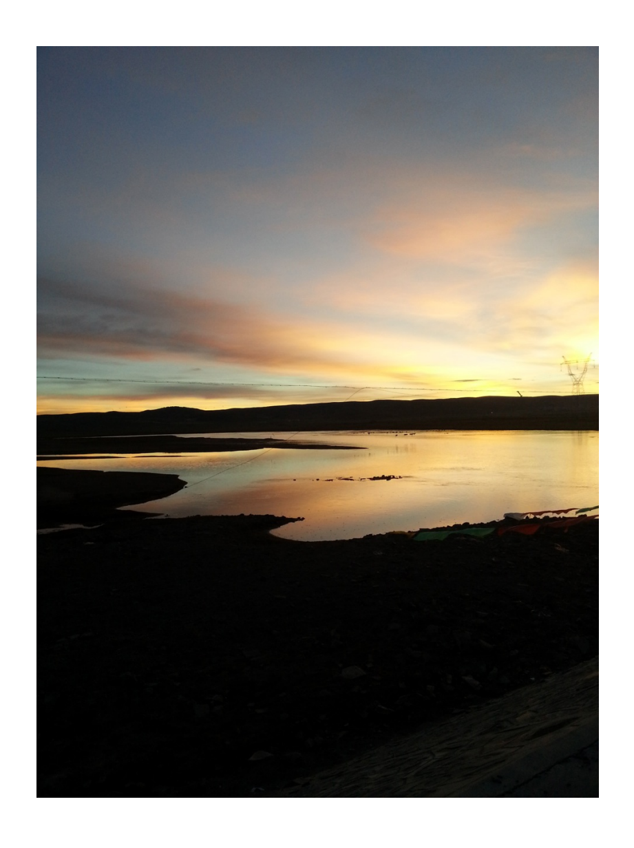
Day 8, 19th June

Birding in Kandashan Mountain, main target birds are Tibetan Bunting which took a hard try for the first sight, but later it's turned out a easy and excited calling bird there, White-tailed Rubythroat was a hard at that time, no calling at all, only one brief flying sight then disappeared into the bushes, never show again. Red-fronted Rosefinch and Grandala high up on the top of the mountain with Tibetan Snowcocks which were well hidden in the rock part, at least 7 White-eared Pheasant group make us so excited! Lovely White-browed Tit and White-browed Tit Warbler again, Snow Pigeon on the grass, White-capped Redstart and Plain Mountain Finch quite common there, Red-billed Chough, Tibetan Babax and Smoky Warbler (split from Dusky Warbler) were other great target birds got there, babax was very noisy around the village, Tibetan Partridge, Sichuan Tit, White-throated Redstart, Chinese Beautiful and Pink-rumped Rosefinches, White-winged Grosbeak again.