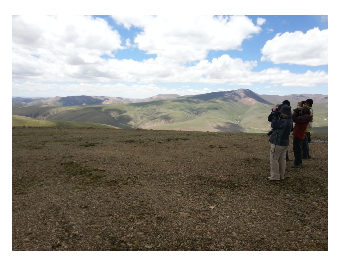
Watching Tibetan Sandgrouse in Ela Mountain