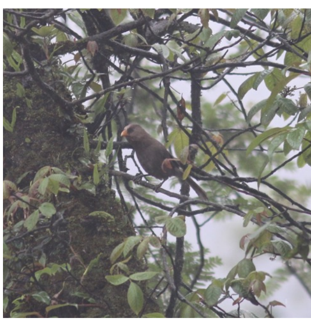
Emei Shan Liocichla & Great Parrotbill