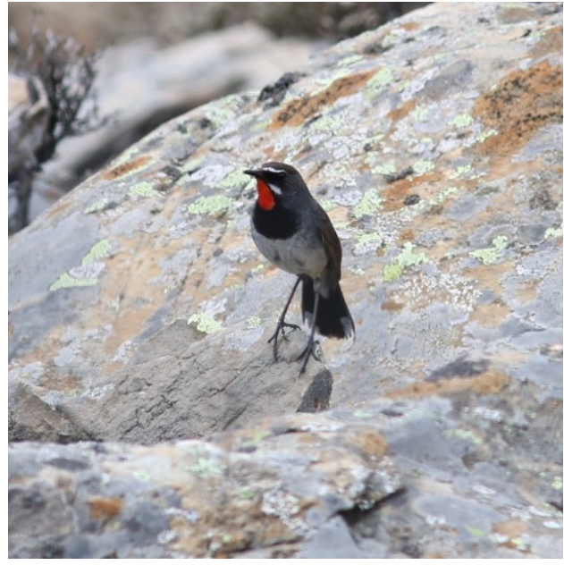
Streaked Rosefinch & White-tailed Rubythroat