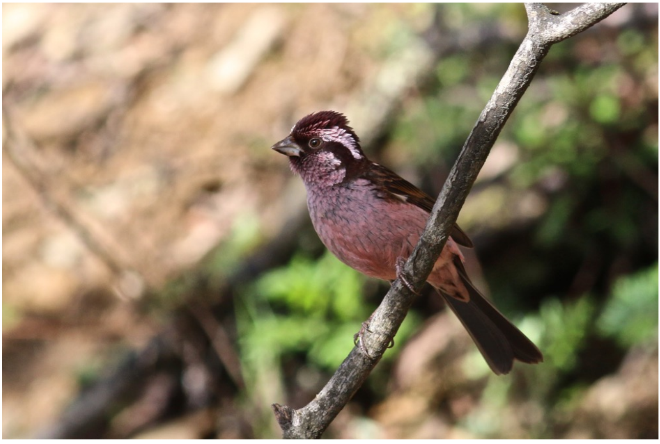
Sharpe's Rosefinch (male) at Balangshan