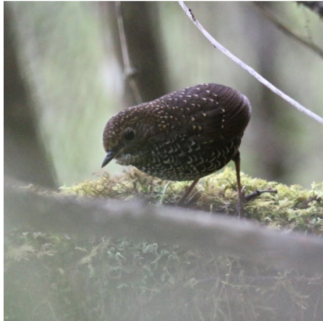
Barred Laughingthrush & Scaly-breasted Wren Babbler