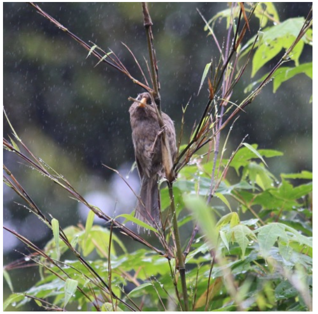
Three-toed Parrotbill in rain