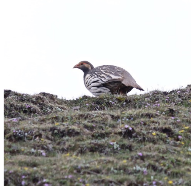
Snow Partridge & Tibetan Snowcock