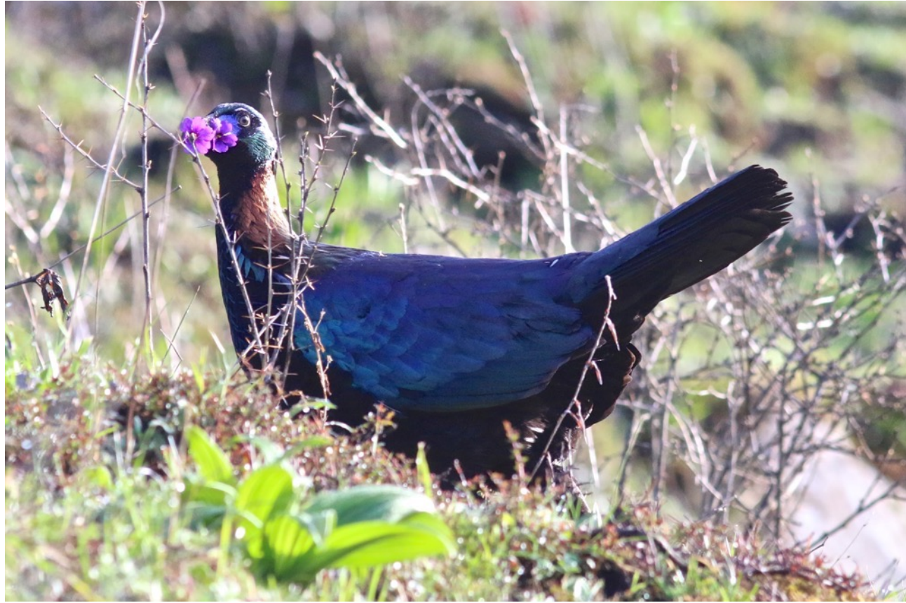
Chinese Monal is eating flowers