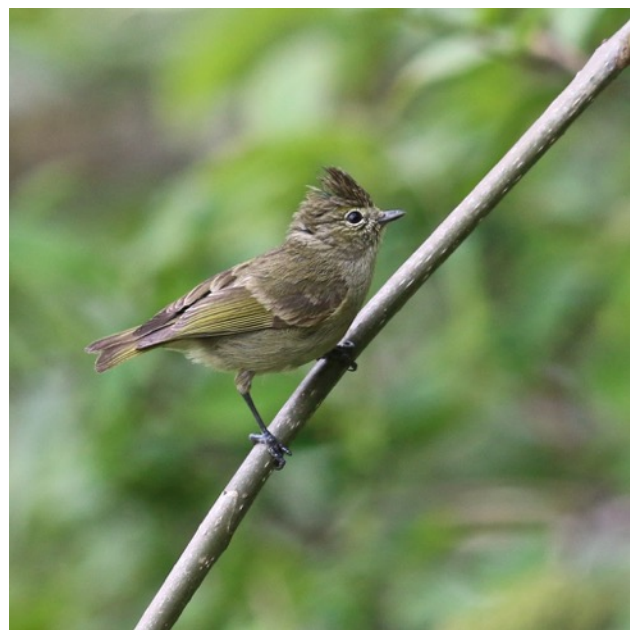
Stripe-throated Yuhina & Yellow-browed Tit