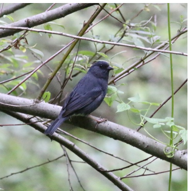
Indian Blue Robin ( male ) & Slaty Bunting ( male )