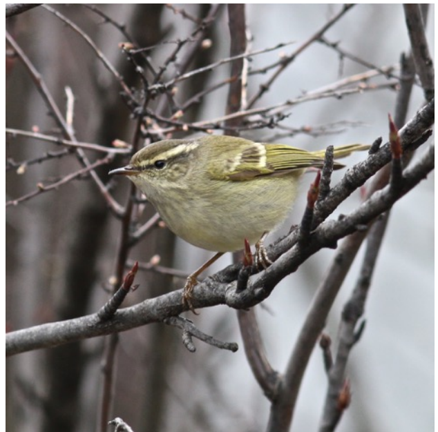
Alpine Leaf Warbler & Hume's Leaf Warbler at Balangshan