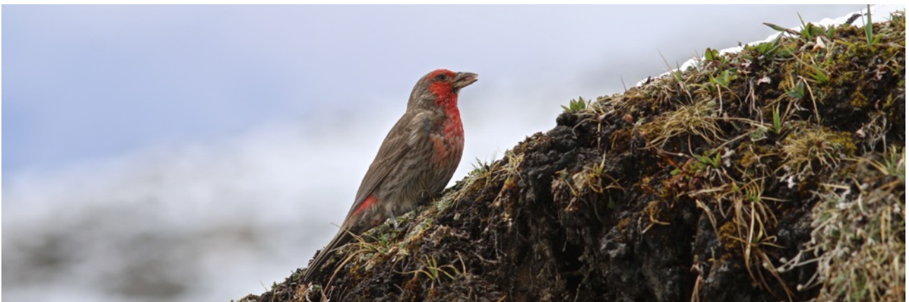
Red-fronted Rosefinch at Balangshan