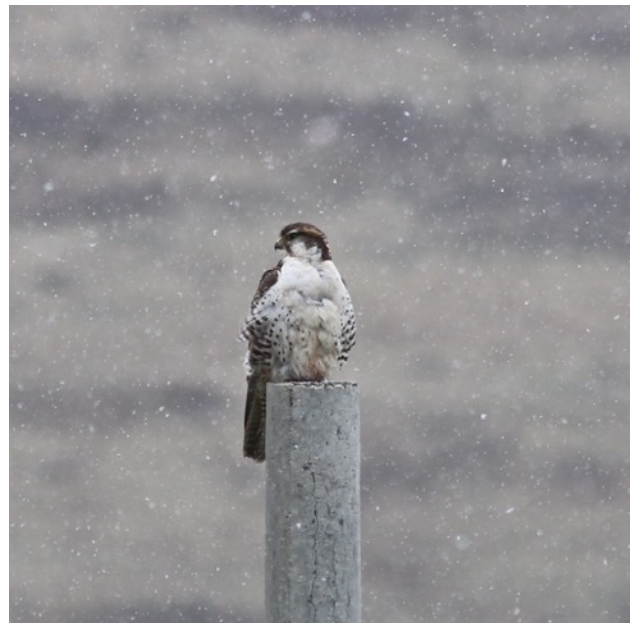
Black-necked Crane & Saker Falcon