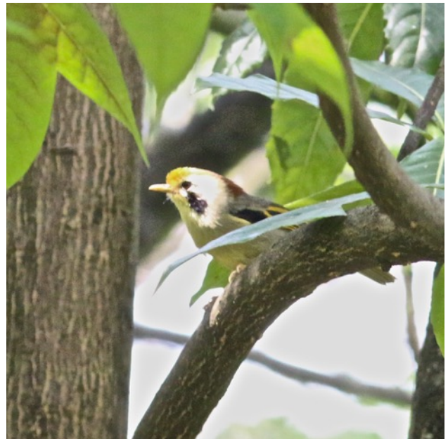
Chinese Blue Flycatcher & Golden-fronted Fulvetta