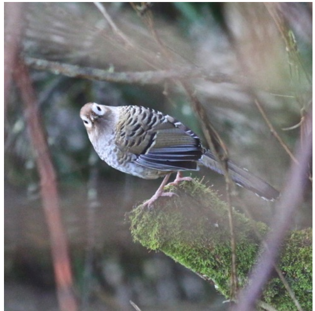
Barred Laughingthrush at Balangshan