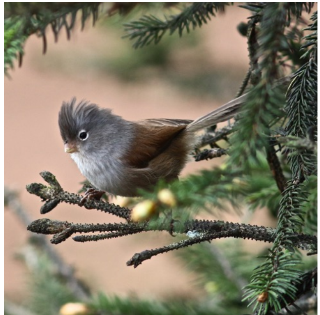
Three-toed Parrotbill & Grey-hooded Parrotbill