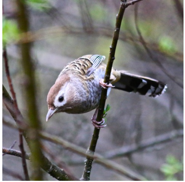
Firethroat & Barred Laughingthrush