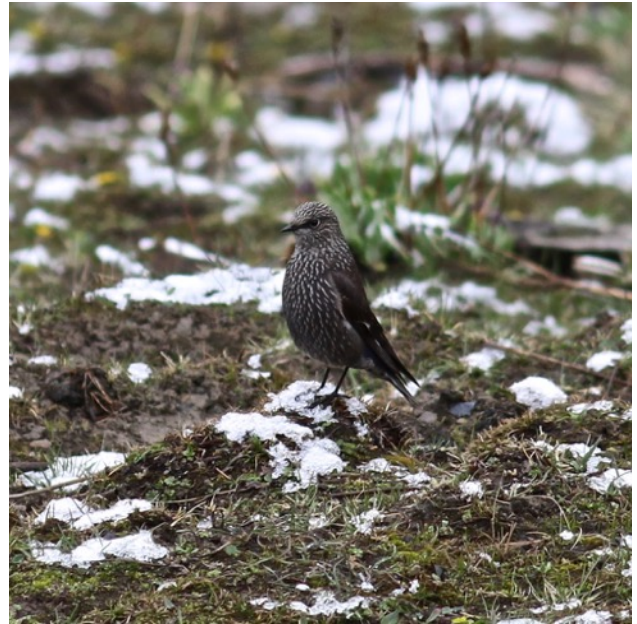
male and female Grandala