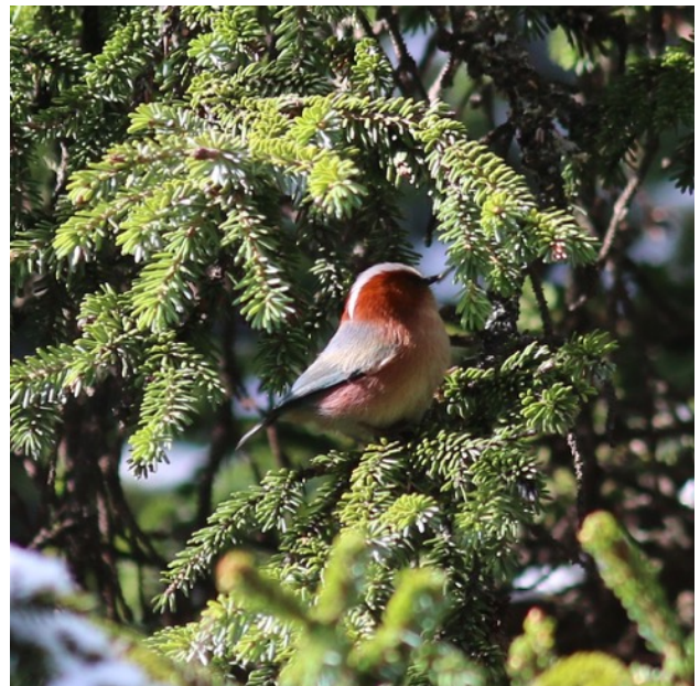
Sukatchev's Laughingthrush & Crested Tit Warbler ( male )