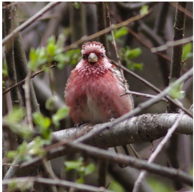
Long-tailed Rosefinch on the way to Maerkang