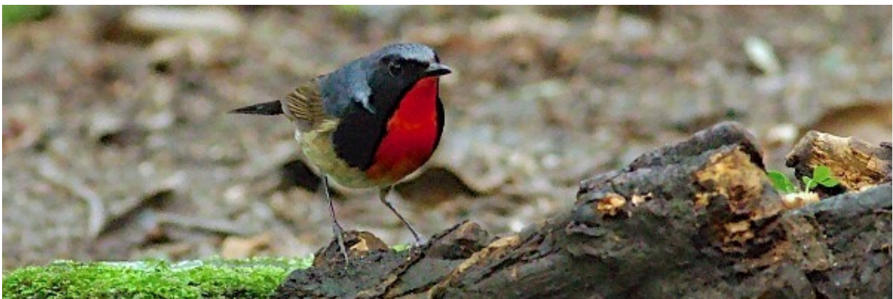
Firethroat at Sichuan University

Other lovely birds of this day : Rufous-faced Warbler, Rufous-capped Babbler, Streak-breasted Scimitar Babbler, White-browed Laughingthrush, Chinese Bulbul, Red-billed Leiothrix, Chinese Blackbird, Grey-capped Greenfinch, Rufous-gorgeted Flycatcher etc.