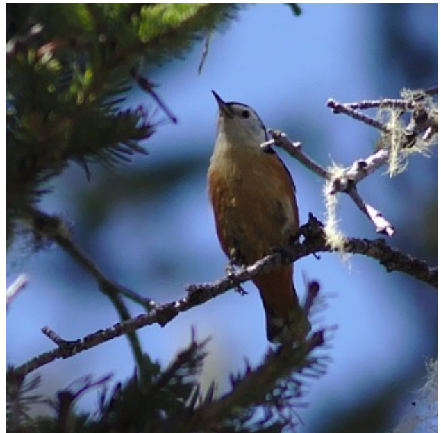
Tibetan Siskin & Przevalski's Nuthatch