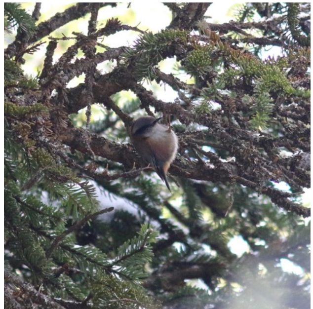
Crested Tit Warbler male and female at Ruoergai