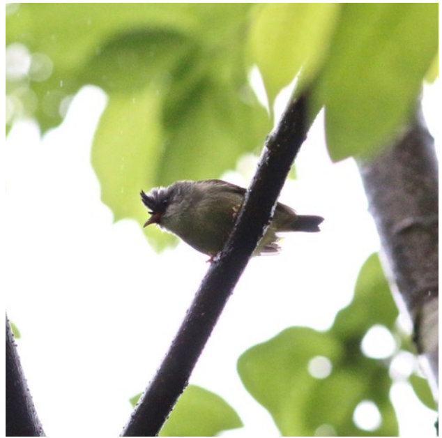
Chestnut-headed Tesia & Black-chinned Yuhina at Longcanggou