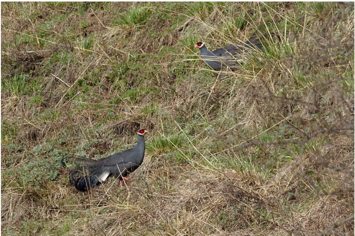
Blue-eared Pheasant