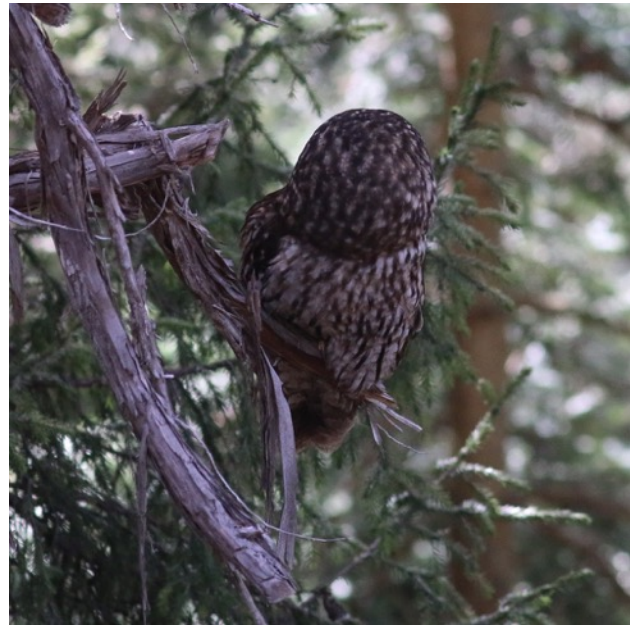
Sichuan Wood Owl