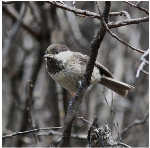
White-tailed Rubythroat & Sichuan Tit at Balangshan