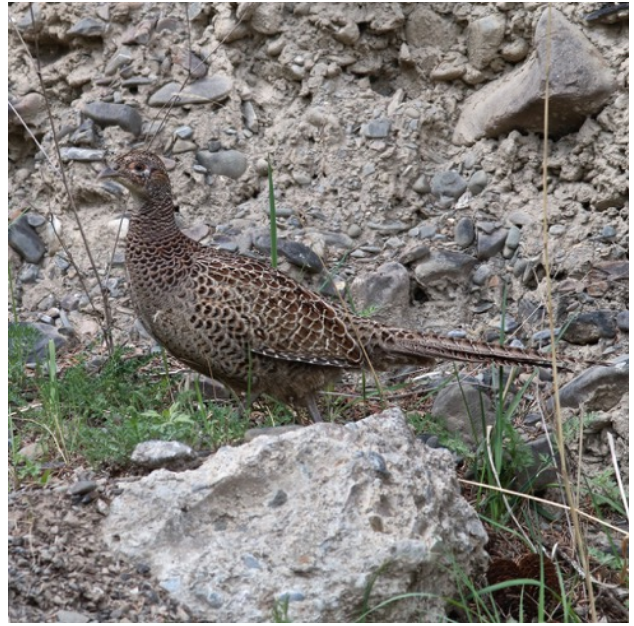
Common Pheasant male and female at Ruoergai