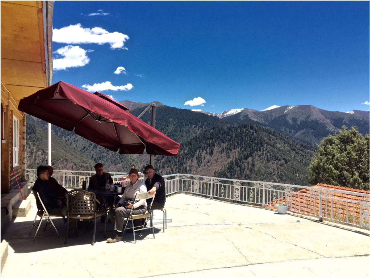
Had lunch on a tibetan buddhism monastery chatting with the monk at Mengbishan