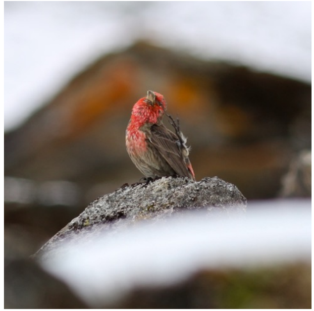
White-browed Fulvetta & Red-fronted Rosefinch at Balangshan