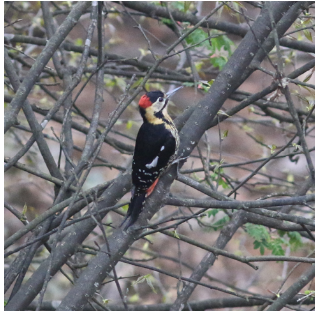
Crimson-breasted Woodpecker Darjeeling Woodpecker at Longcanggou