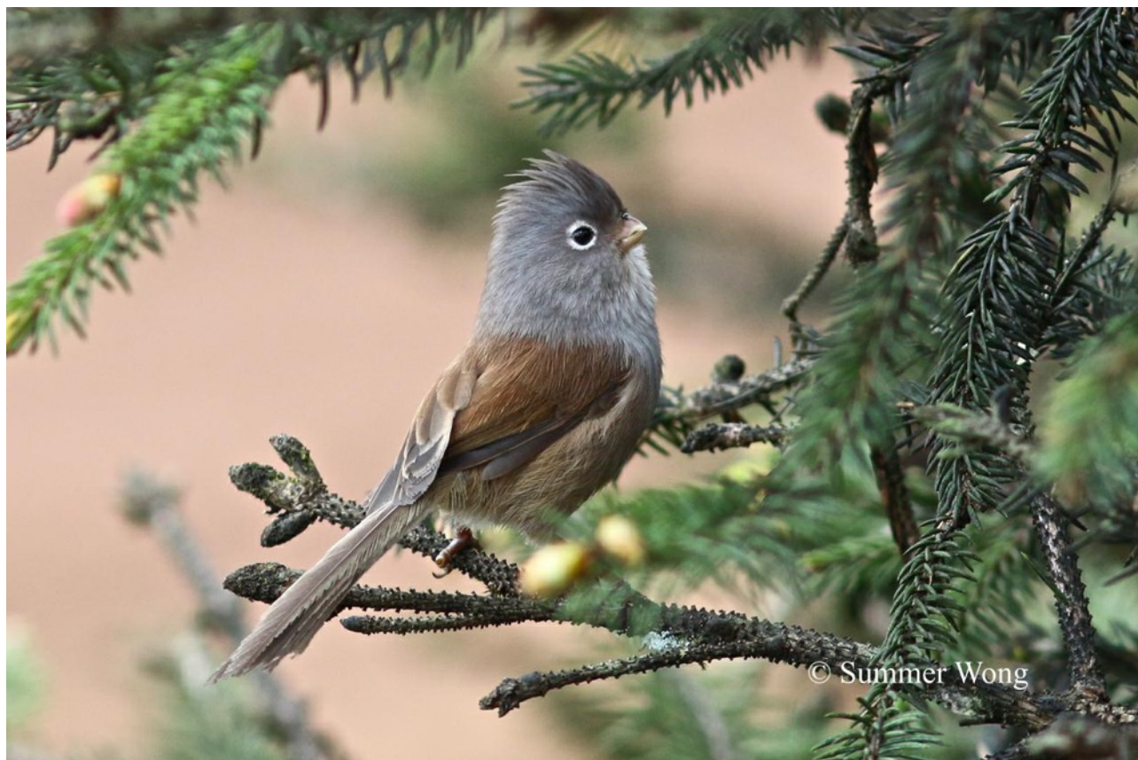
Grey-hooded Parrotbill