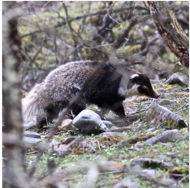
Rufous-bellied Woodpecker & Hog Badger on they way to Maerkang