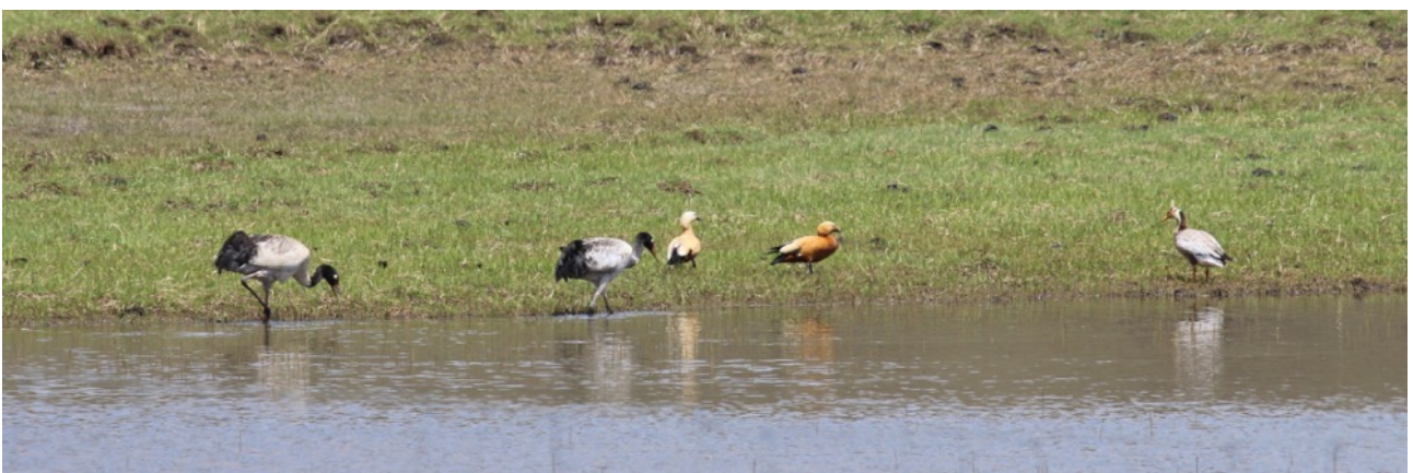
Black-necked Crane, Ruddy Shelduck, Bar-headed Goose