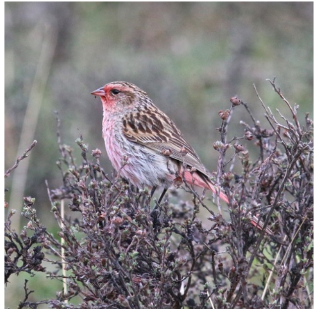
White-browed Tit Warbler ( male ) & Przevalski's Rosefinch ( male )