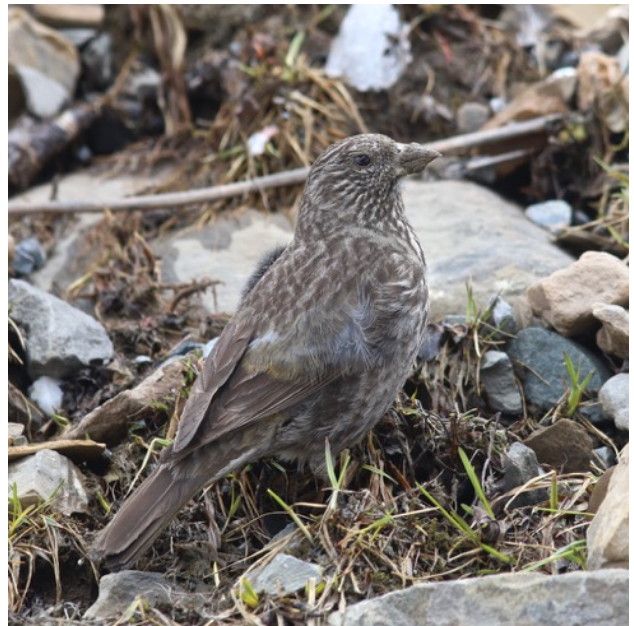
Red-fronted Rosefinch male and female at Balangshan