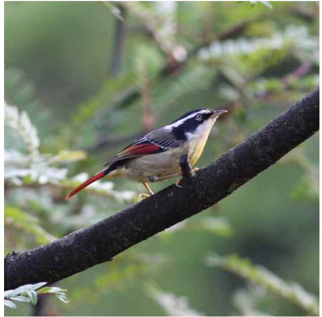
Red-tailed Minla at Longcanggou