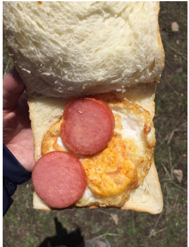
Fried eggs with soy source and ham for breakfast samwich