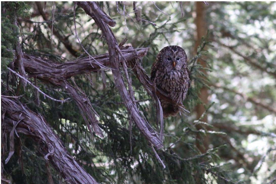
Sichuan Wood Owl