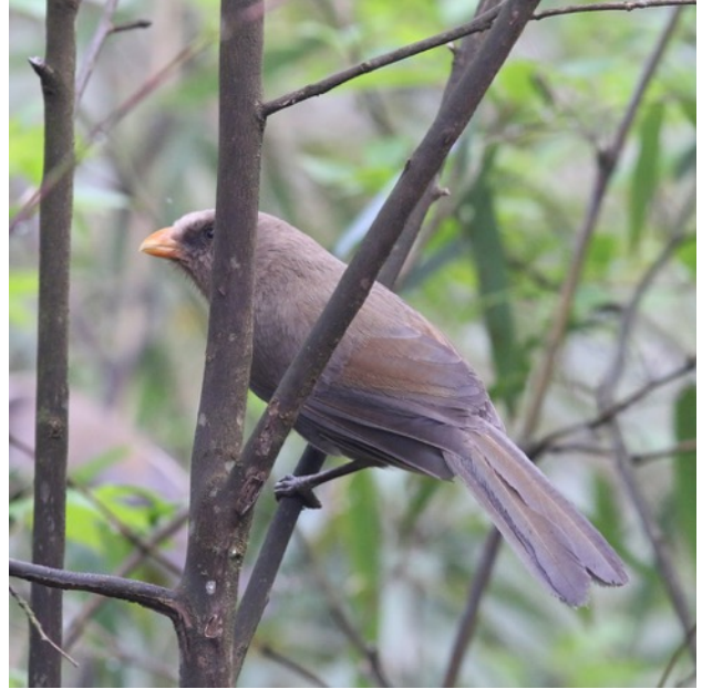
Golden Parrotbill & Great Parrotbill