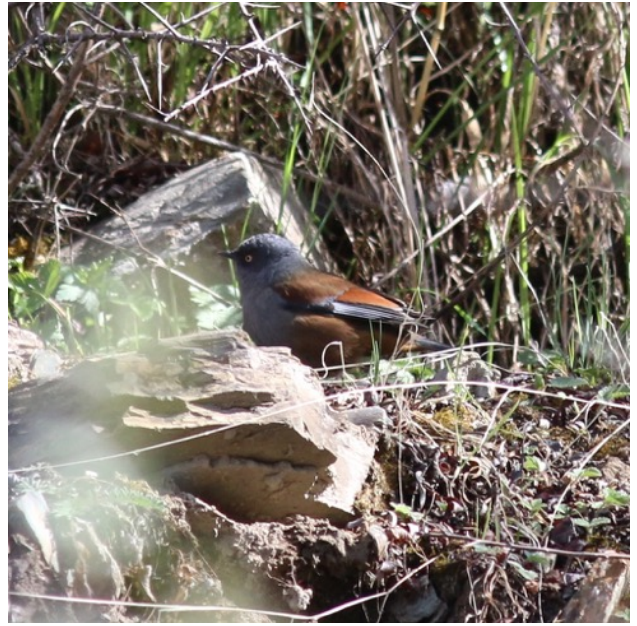
Black Woodpecker & Maroon-backed Accentor at Ruoergai