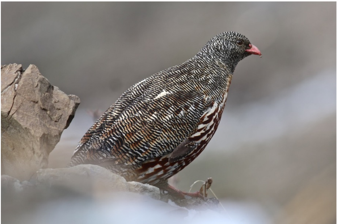
Snow Partridge at Balangshan