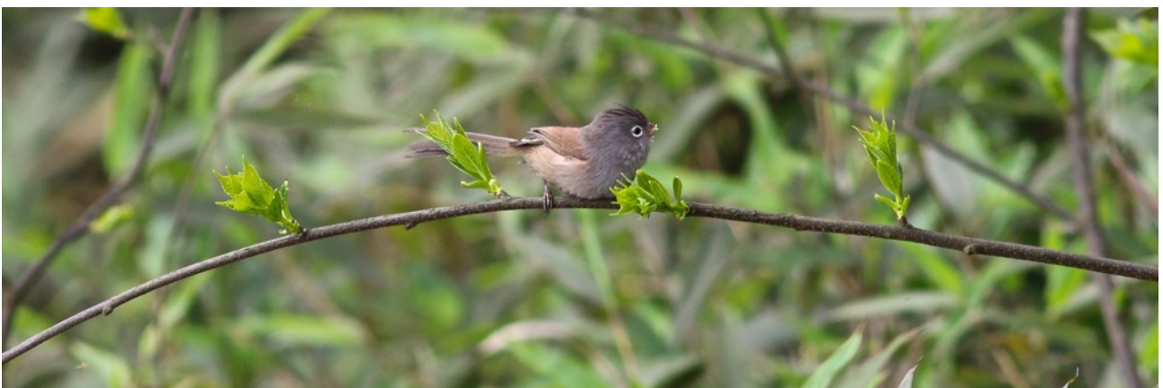
Grey-hooded Parrotbill at Longcanggou