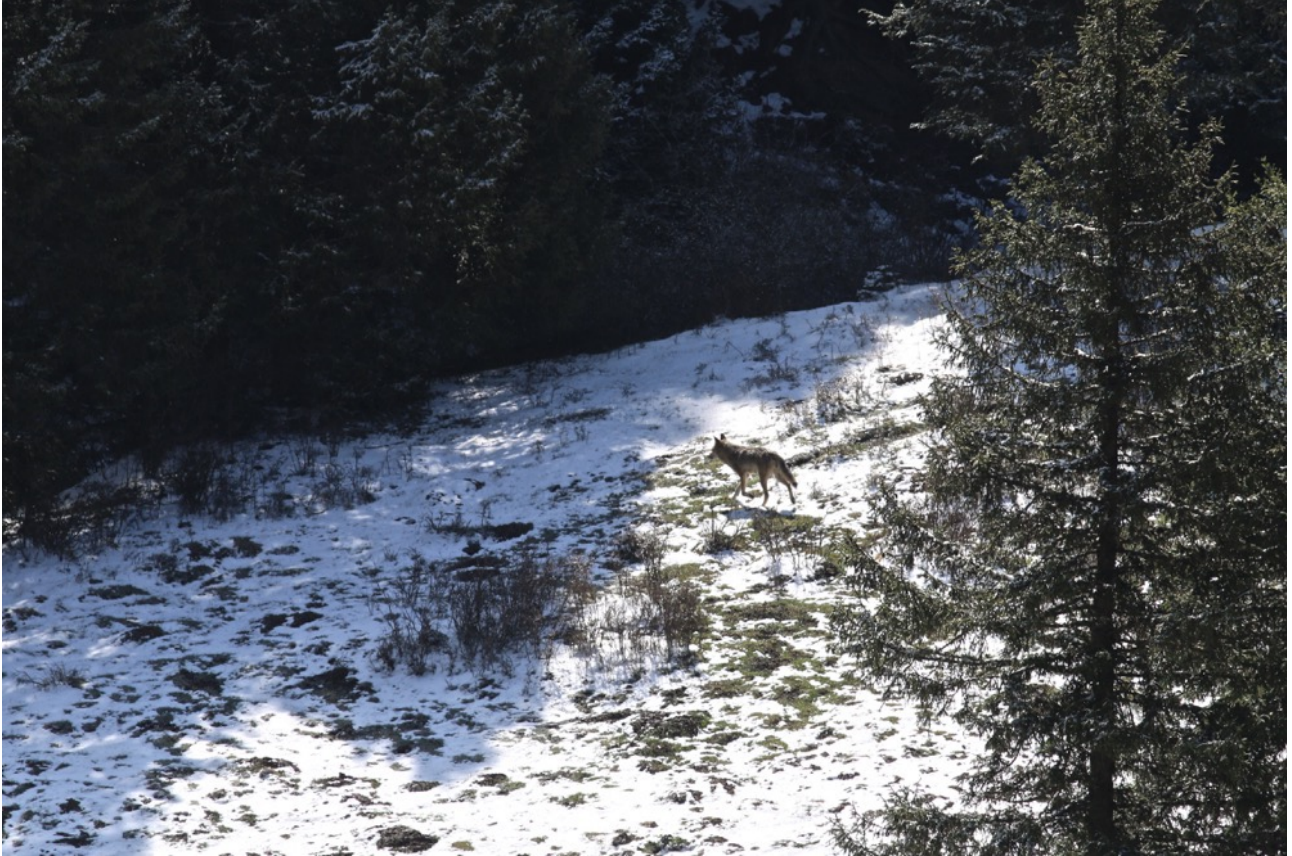
one of the 3 Wolves walking through pine forest at Ruorgai