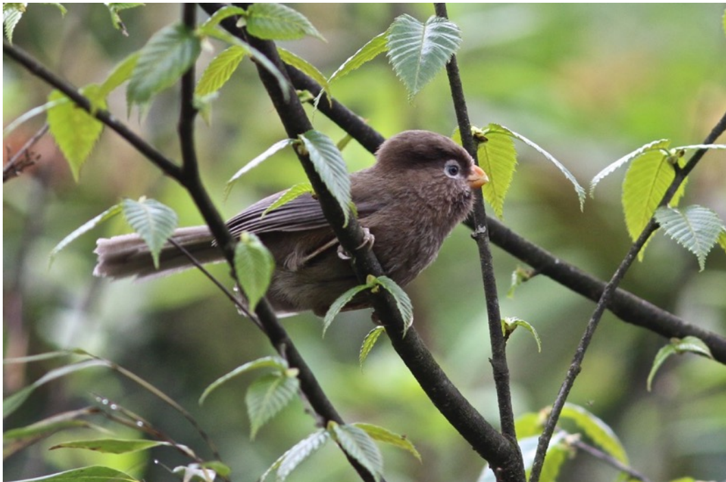
Three-toed Parrotbill at Longcanggou