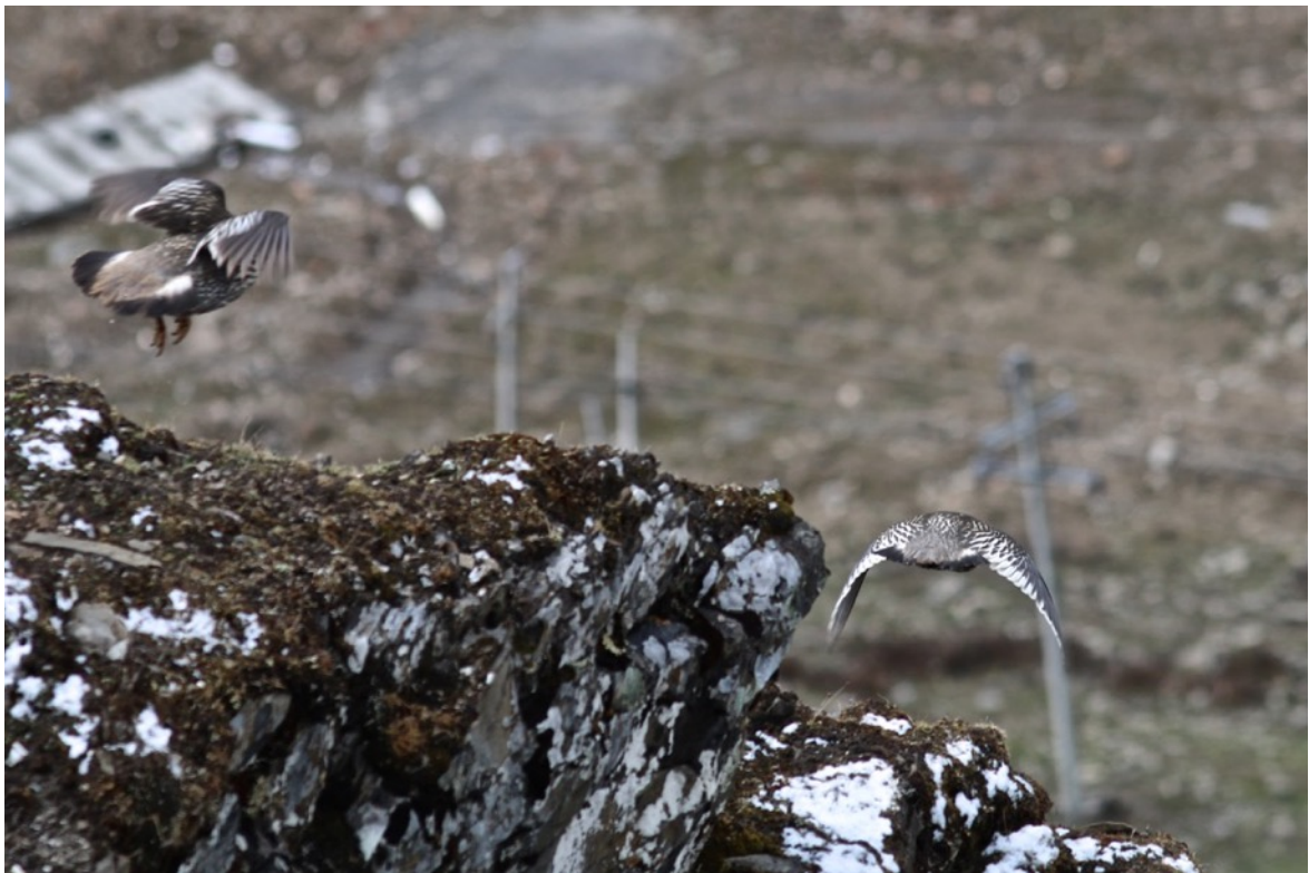
Snow Partridge (up) & Tibetan Snowcock in flying (down) at Balangshan