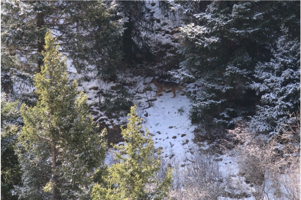
Wolf at Ruoergai