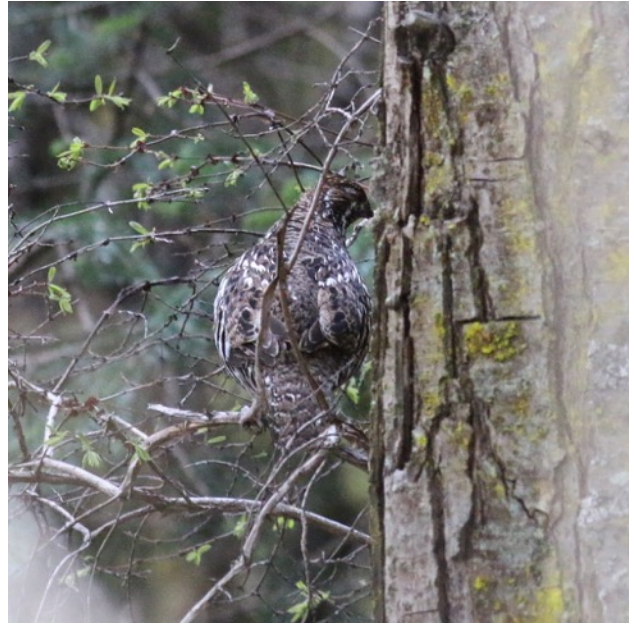
Siberian Rubythroat & Chinese Grouse