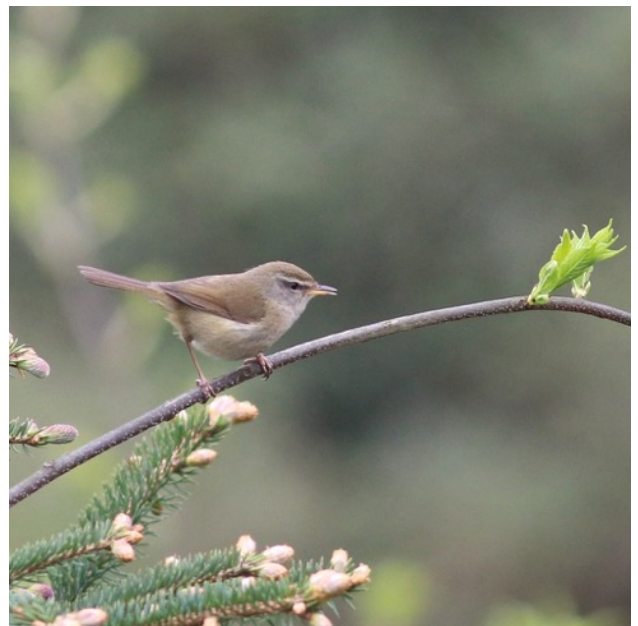
Brown Bush Warbler & Aberrant Bush Warbler at Longcanggou