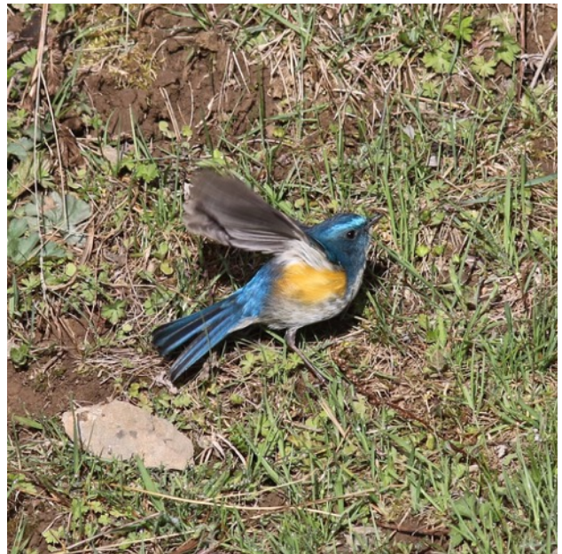
Three-Banded Rosefinch & Himalayan Bluetail at Ruoergai