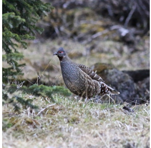
Blood Pheasant & Chestnut-throated Partridge