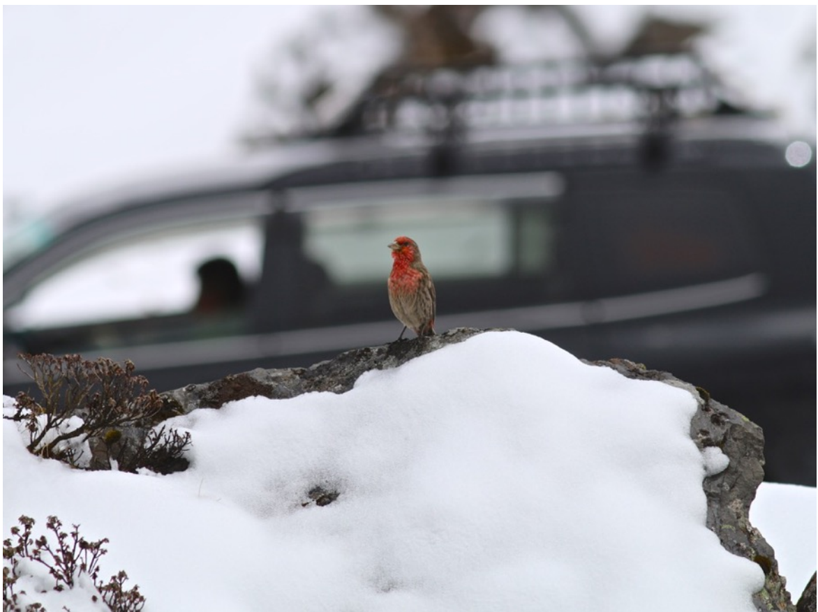
Red-fronted Rosefinch at Balangshan