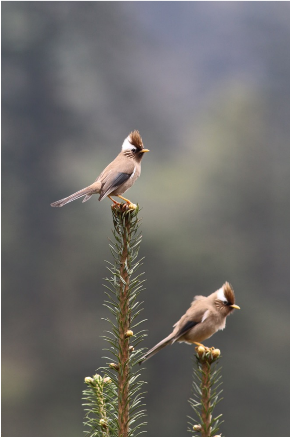
White-collared Yuhina at Longcanggou