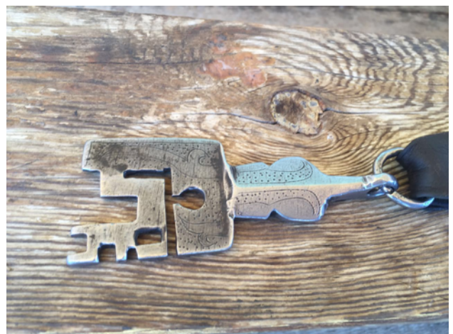
An over 1000-year-old key for the monastery