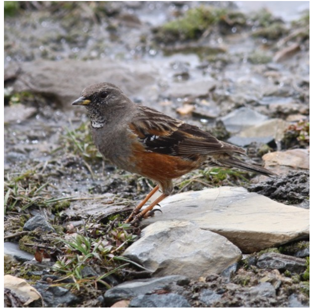
Giant Laughingthrush & Alpine Accentor at Balangshan