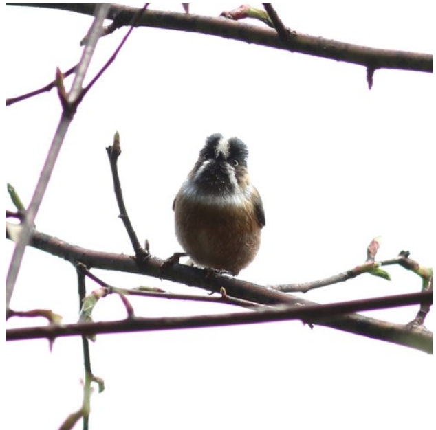
White-throated Dipper & Black-browed Tit at Balangshan